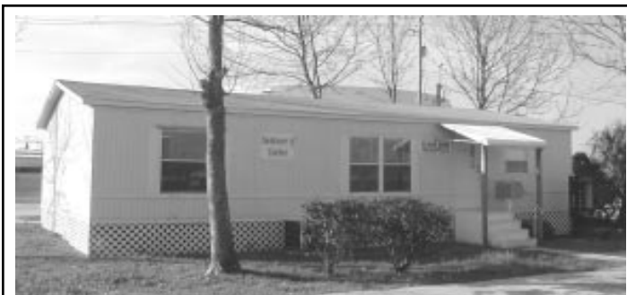
International Seafarers' Center, Port of Tampa: Episcopal, Southern Baptist, and Roman Catholic.