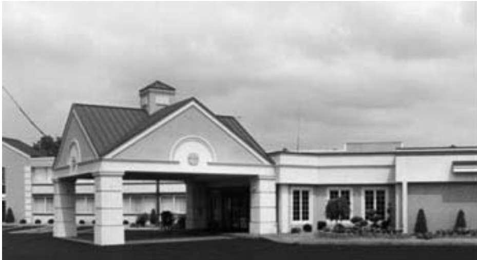
Holiday Inn- Buffalo/Amherst, I-290, Exit 3 (US 62 or Niagara Falls Blvd.)